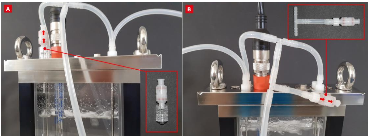
Fig. 2 Pressure relief valve: installation.

A) Pressure relief valve connected in the empty luer connector that is placed in the lid. Male to male reduction is used. Black arrows indicate the proper orientation of the valve. The relief valve must lead in the headspace not in the liquid. B) Pressure relief valve connected into the aeration tubing. Male Luer Lock Connector with T-connector are used. Black arrows indicate the proper orientation of the valve.