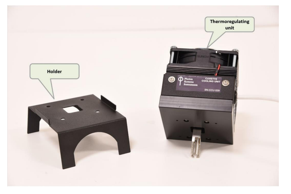
Fig. 1 Thermoregulator components.