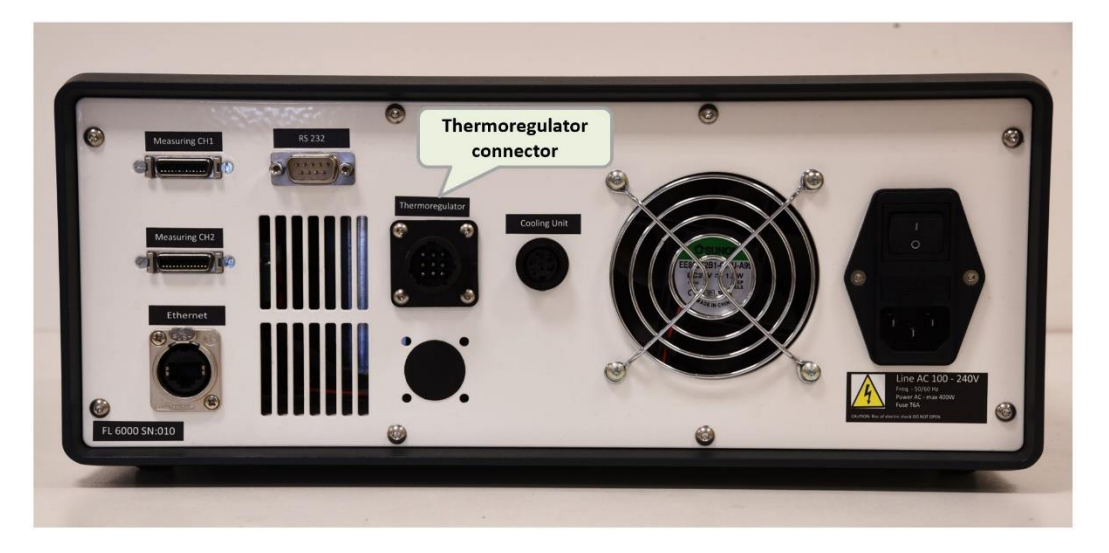
Fig. 3 Rear side of FL 6000 control unit.

Connect the thermoregulating unit cable into thermoregulator connector on the rear side of FL 6000 control unit (Fig. 3).